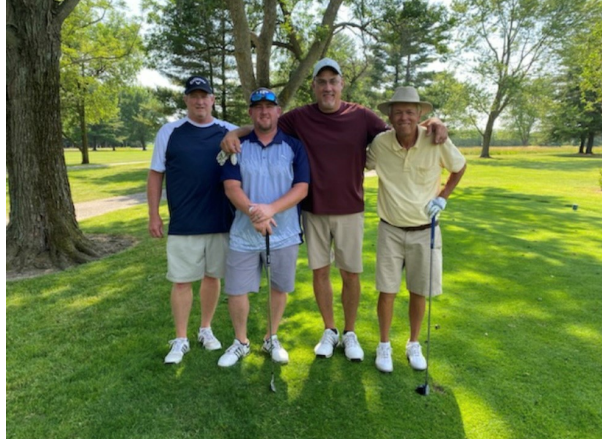
2021 Golf Tournament Champions, United Builders

After a long day of golfing, enjoy this delicious buffet style dinner of fried chicken, mashed potatoes & gravy, tortellini, green beans, corn, and dinner rolls! All made possible by Bank & Trust Company!